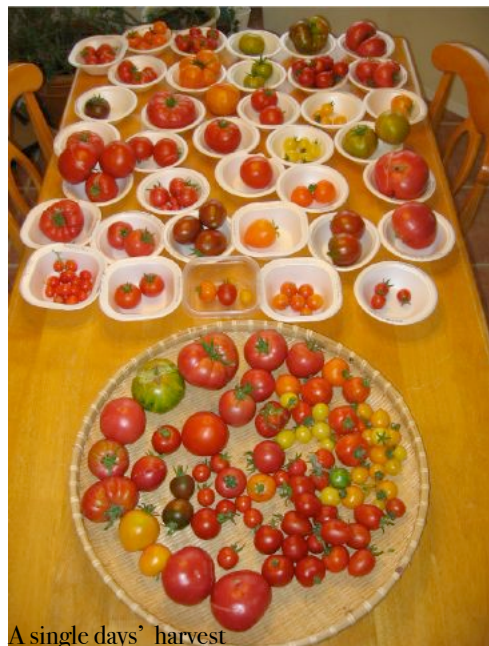
A single days' harvest

My love for growing vegetables has grown exponentially from my first miniscule plot out behind my teachers' housing unit in a small town in Hokkaido, Japan to my current garden in which I grew 85 different tomato varieties last year.